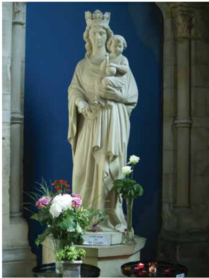
Our Lady of Mount Carmel Cathedral of St Pierre, Lisieux. France.

Near the cross of Jesus stood his mother and his mother's sister, Mary the wife of Clopas, and Mary of Magdala. Seeing his mother and the disciple he loved standing near her, Jesus said to his mother, 'Woman, here is your son'. Then to the disciple he said, 'Here is your mother.' And from that moment the disciple made a place for her in his home.