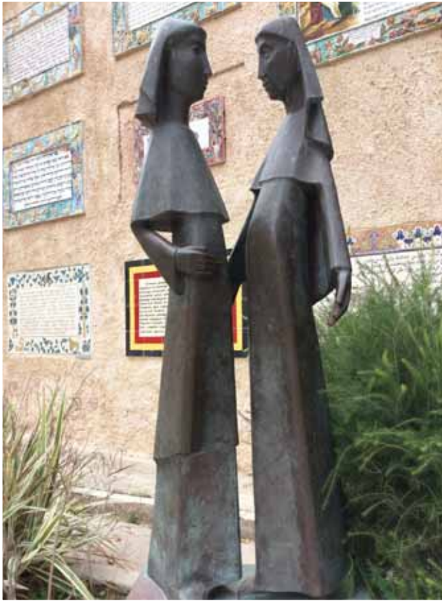
Meeting of Our Blessed Lady with her cousin Elizabeth The Visitation scene at the Church of the Visitation Ein Karen, The Holy Land

O n being greeted as the 'Mother of my Lord' (Luke 1) by her cousin Elizabeth, Our Blessed Lady replied with the song of praise we know as the Magnificat .