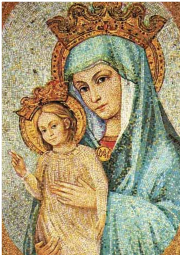
The Blessed Virgin Mary Mother of the Church

Pope Francis, in his homily during Mass on 22 May 2018 the Memorial of the Blessed Virgin Mary, Mother of the Church, noting that in the Gospel Mary is always described as the Mother of Jesus, said that her motherliness is emphasised throughout the Gospels beginning with the Annunciation.