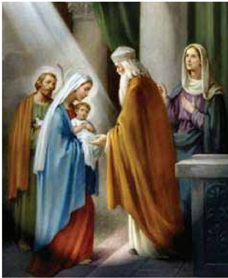
The Presentation of the Lord

Then Simeon blessed them and said to his mother Mary, 'This child is destined for the falling and the rising of many in Israel, and to be a sign that will be opposed so that the inner thoughts of many will be revealed – and a sword will pierce your own soul too.'