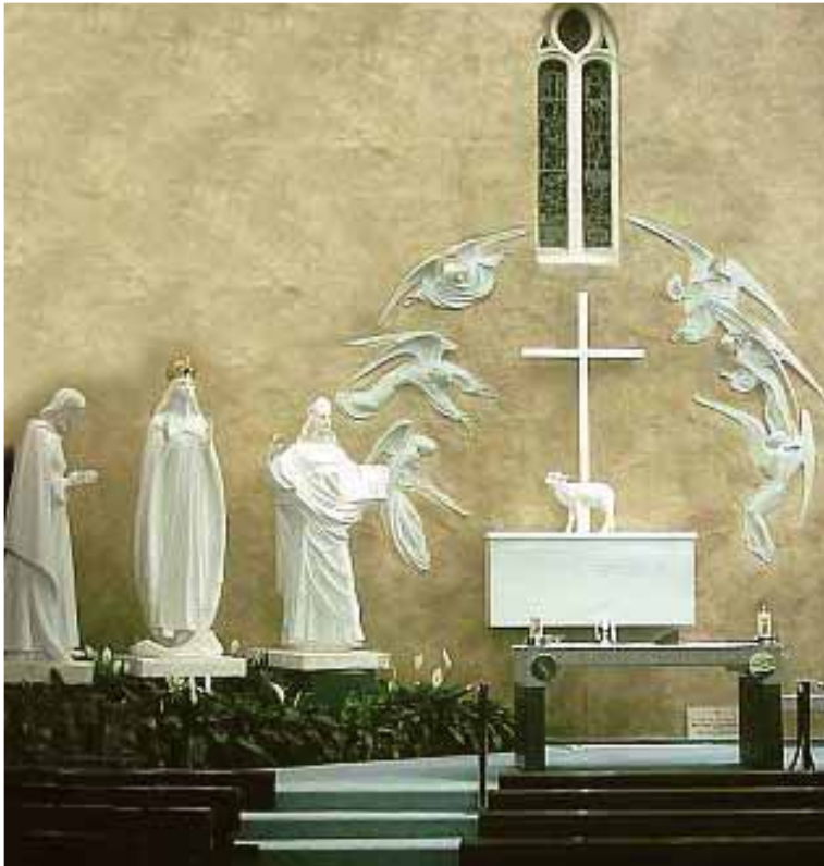
The Apparition Chapel, Knock St Joseph Spouse of the Blessed Virgin Mary and Protector of the Universal Church is to the left.