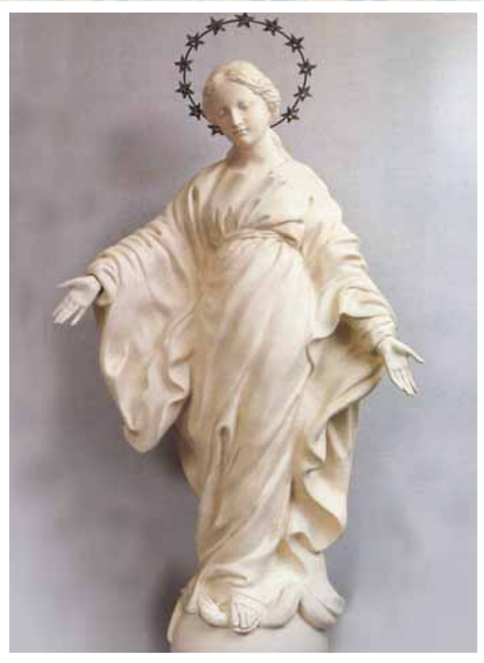
The Virgin of the Smile