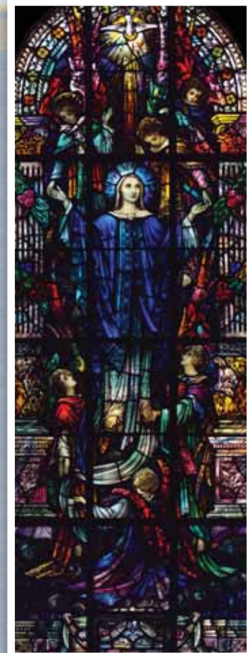
The Rosary Windows depicting scenes from the life of Our Blessed Lady Church of Our Lady of Mount Carmel, Whitefriar Street, Dublin. Ireland.