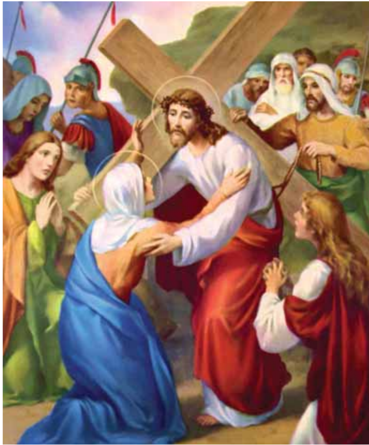
Jesus meets His Mother

Doing the Stations of the Cross, especially during Lent, is a long established devotion of reflection on the Passion and Death of Our Lord Jesus Christ and the events which led to His Crucifixion. The Blessed Virgin Mary, His Mother, accompanied Jesus as He carried His Cross and was standing at the foot of the Cross when Jesus said 'Woman, here is your son' and to the disciple John 'Here is your mother'.