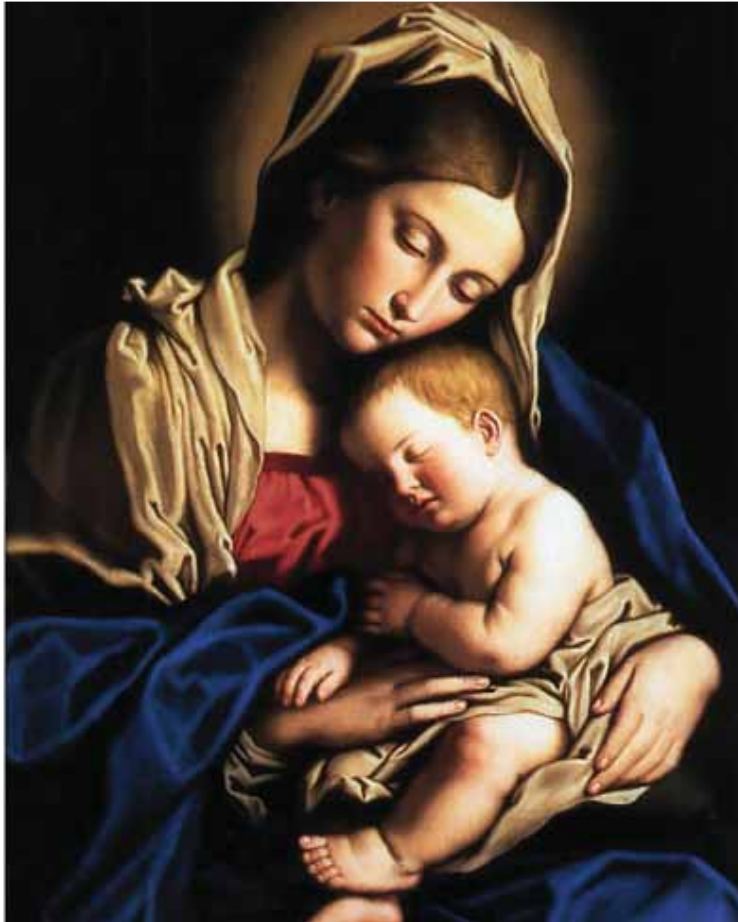
Mary, the Most Holy Mother of God

Mary ground of all being Greetings! Greetings to you Lovely and Loving Mother!