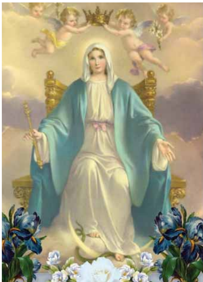
Mary, Queen of Heaven