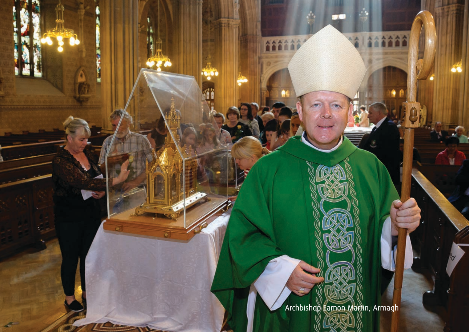
Archbishop Eamon Martin, Armagh