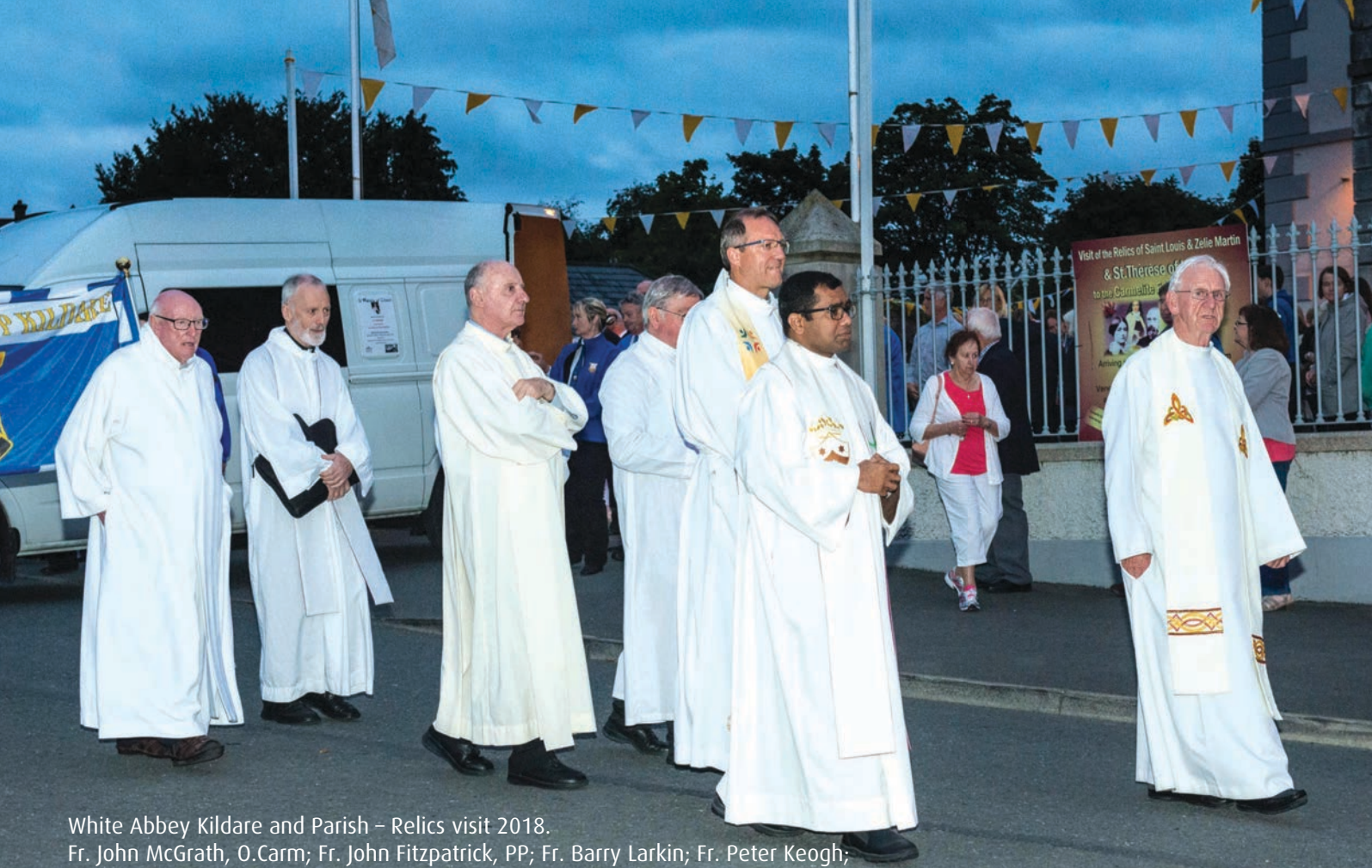
White Abbey Kildare and Parish – Relics visit 2018.