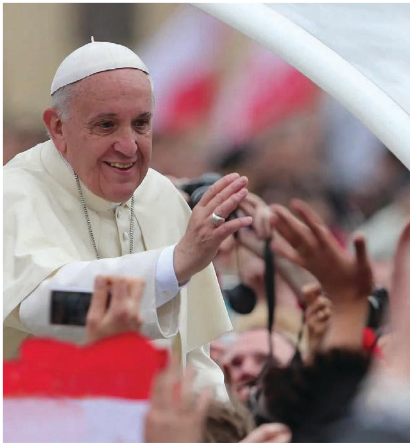
Pope Francis, Phoenix Park, Dublin.