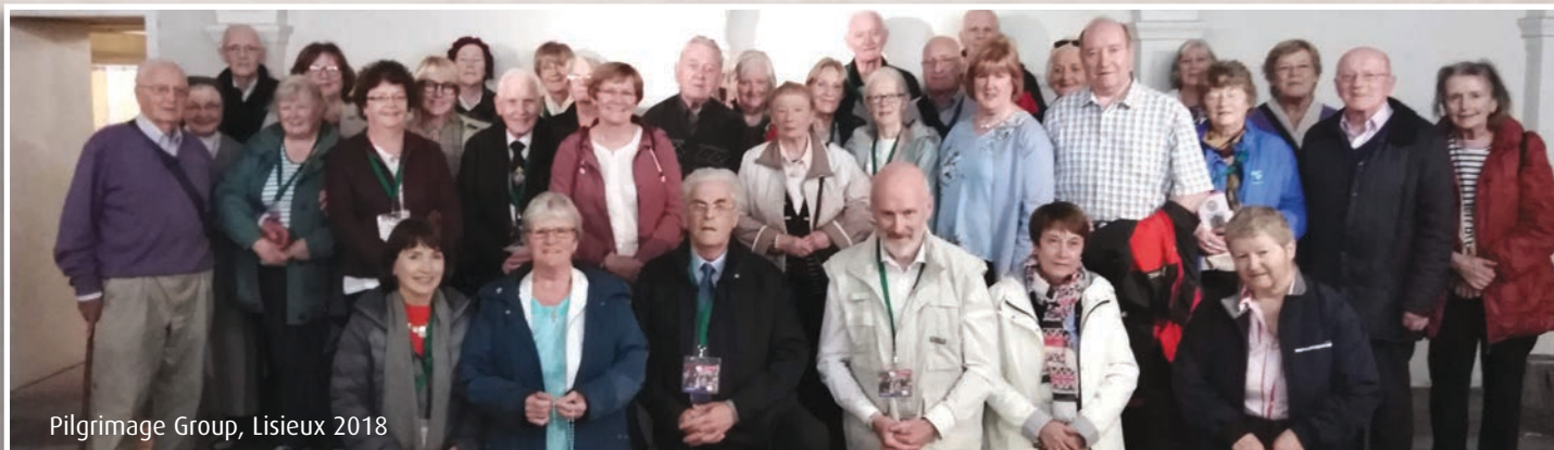
Pilgrimage Group, Lisieux 2018