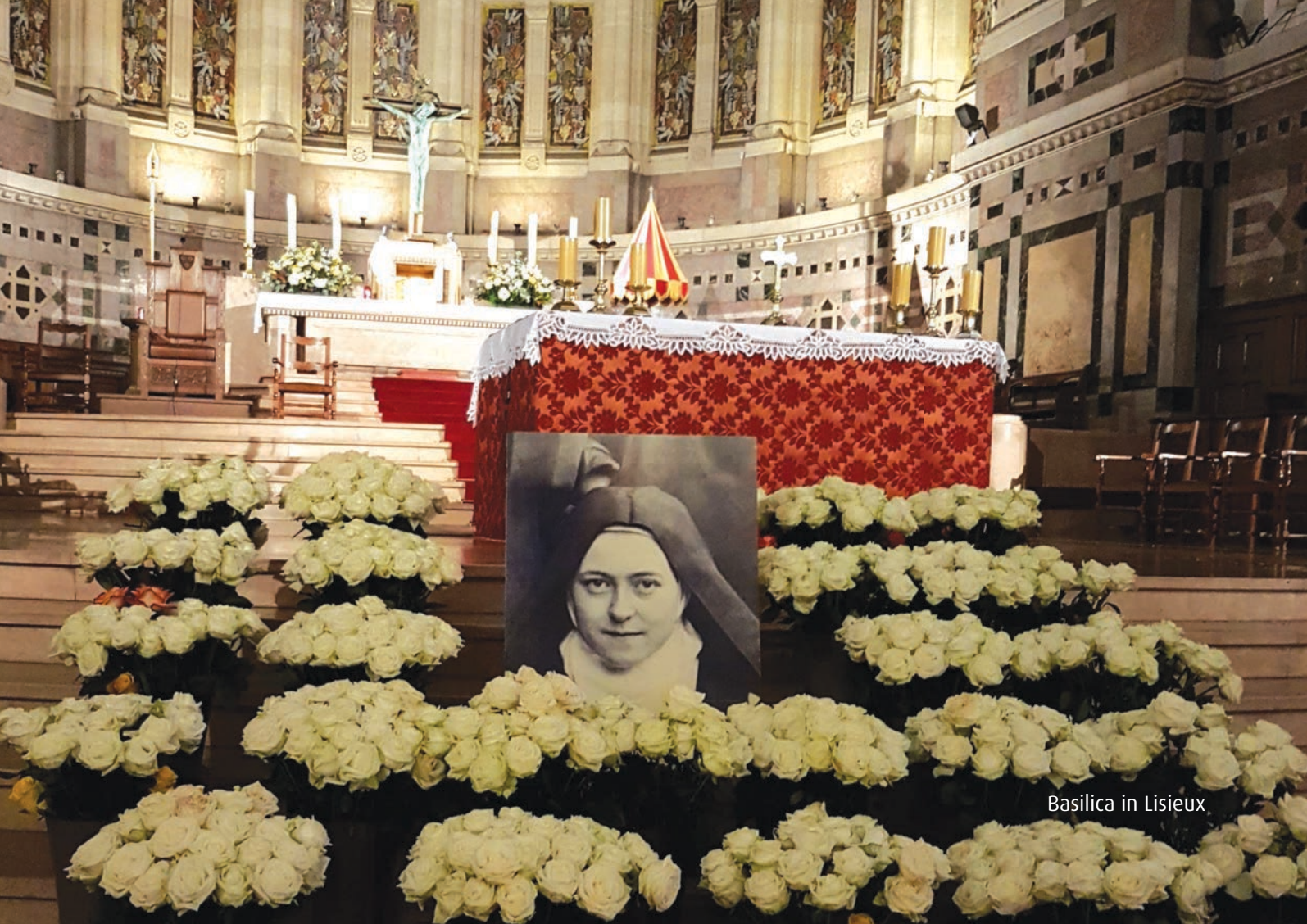
Basilica in Lisieux